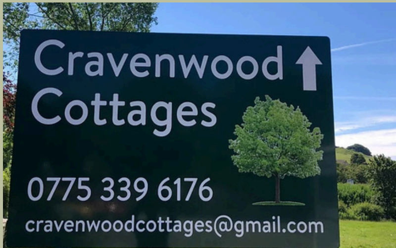
Cravenwood Cottages, Embsay (Min 2 nights) Email: cravenwoodcottages@gmail.com Website: https://www.cravenwoodcottages.co.uk