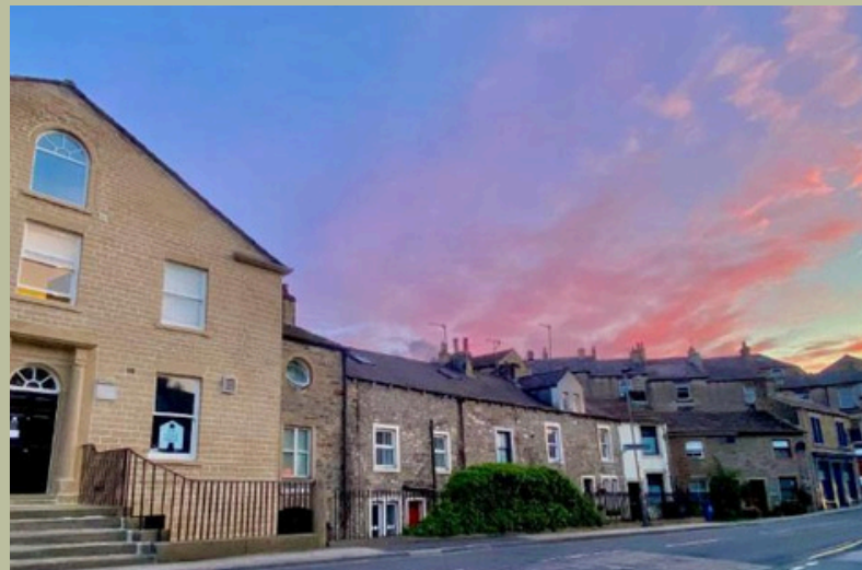
The Coach House, Skipton Email: hello@thecoachhouseskiptom.com Phone: 01756 799688