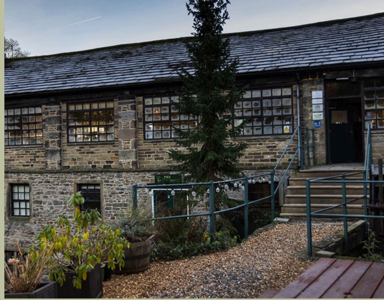
The Eller Beck, High Corn Mill Skipton (Min 2 nights) Email: thehighcornmill@gmail.com Phone: 07966 421531