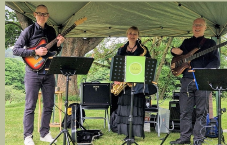
Park Avenue Jazz Quartet Jazz Standards & Latin Jazz Tunes parkavenuejazzquartet@gmail.com