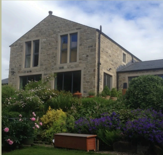
Highfields B&B Chapel Hill, Skipton Email: sandscooper@btinternet.com Phone: 07855 699159